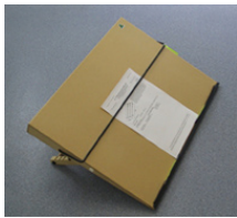
Angled Writing Surface

A range of adapted pens are also available that suit an individual's particular needs.