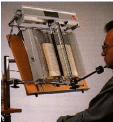
Electric Page Turner

Overbed tables with a tilting surface may also be helpful when reading, writing or completing other tasks from bed.