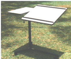
Over Bed Table