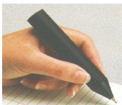
Weighted Pen with built up handle

Pens/Pencils with built up shafts are also easier to grip for people with a weak grip or painful hands. A range of specialised pen holders are also available to assist these people.